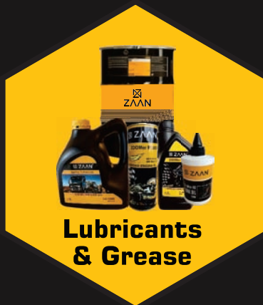
Lubricants & Grease