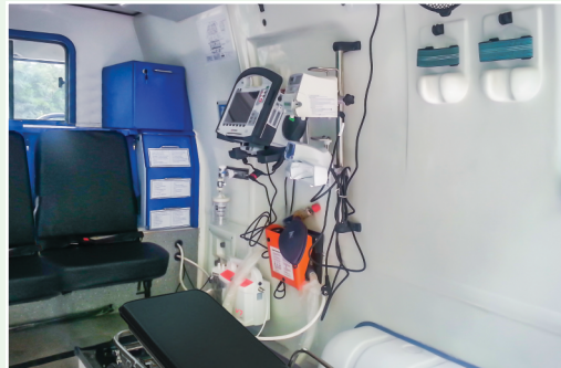
Side wall reinforced to mount Defibrillator, Ventilator, Suction Pump etc.