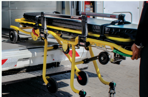
Auto Loading Stretcher - with foldable legs