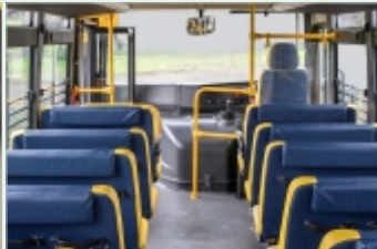
Grab Handles, Stanchion Bar & Chin Guard for safety