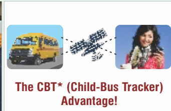
The CBT* (Child-Bus Tracker) Advantage!