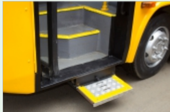
Low foot step and Hand Rail for easy entry & exit