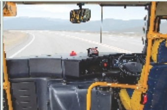
Smart Dashboard & large internal rear view mirror