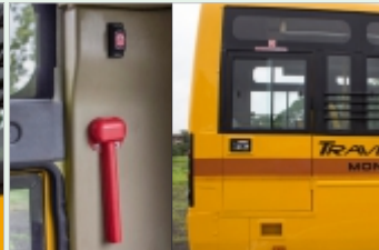
Easy access, Emergency Door Options