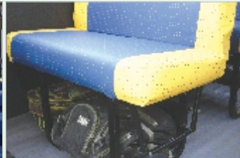
Convenient under seat storage