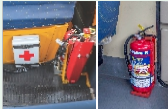
First-Aid, Fire extinguisher & FDSS in case of emergency