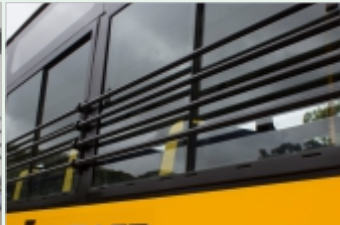
Thoughtfully placed Bar railing for additional safety