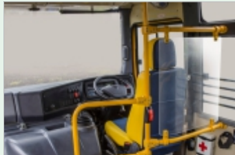
Driver partition provided