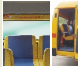
Emergency Exit Door for Easy Exit