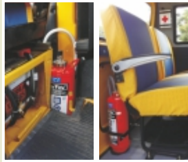
Fire Extinguishers in case of an emergency