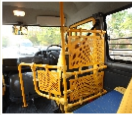
Large Internal Rear View Mirror and Driver partition