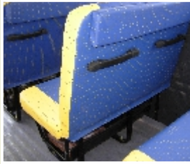
Chin Guard & Grab Handle