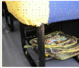
Racks for School Bags