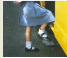
Low foot step for easy Entry & Exit