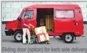
Sliding door (option) for kerb side delivery