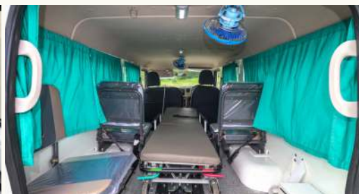
Foldable seats for convenient movement, Swivelling Fans and Ample lighting