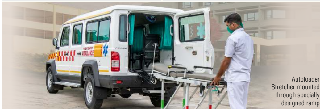
Autoloader Stretcher mounted through specially designed ramp