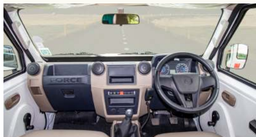
All new interiors, new seats, dual tone dashboard and new instrument cluster

The fully factory built, All New Trax Ambulance is ready to use from day one. The independent front suspension and parabolic rear suspension ensure best in class ride quality for the patient. The new G-28 Synchronesh Gear Box with Cable Shift ensures smooth and quick gear changes. The Trax Ambulance is ideal for use in narrow congested lanes and the rough road conditions in the rural areas.